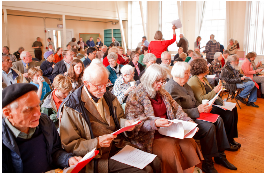
Above: The Profile and Search Committee will soon need the input of the parish to complete the Parish Profile. File photo from 2011 Annual Meeting.

After the forum, the parish feedback will be incorporated into the profile, which the Profile and Search Committee will present to the Vestry at their October 18 meeting for their approval. When the Vestry has approved it, the profile will be sent to the Diocesan Office for their review,